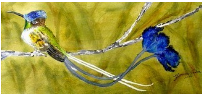
Yvonne Kakim "Spatuletail Humming Bird"