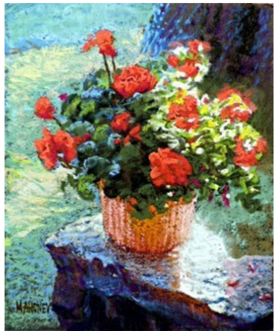
Patrick Mahoney “Backyard Geraniums”

Choose your best work. Some will also be used on a CD showing examples of our work to galleries where we are trying to get exhibitions. Use your name in the title. 7 inches maximum per size @ 150 dpi resolution. No frame should be in the photo. 5 images for each member. Please include contact information.