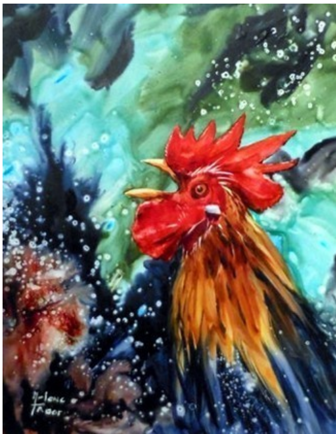
Arlene Tabor "Great Expectations"