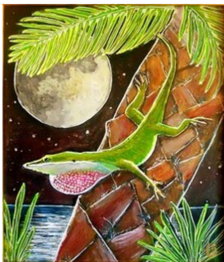
"Moon Lizard" Acrylic on Canvas

This acrylic painting was accepted in the St. Augustine Art Association 2016 Annual Fall Member Show for the month of September.